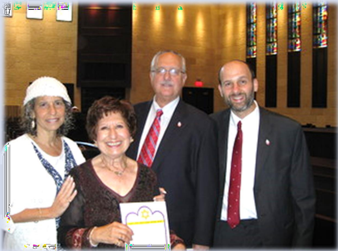
Ladies Bat Mitzvah 2009 Spanish & Portuguese Synagogue of Montreal