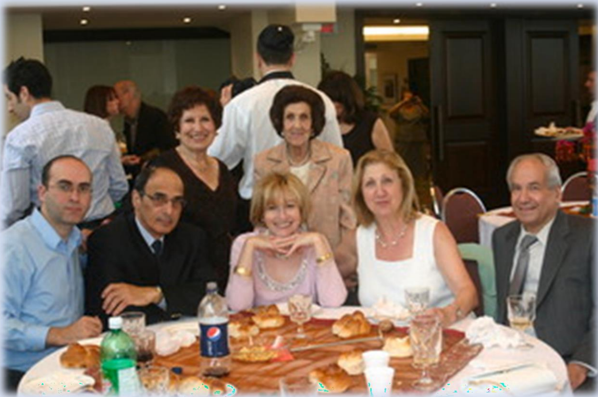
Ladies Bat Mitzvah 2009 Spanish & Portuguese Synagogue of Montreal