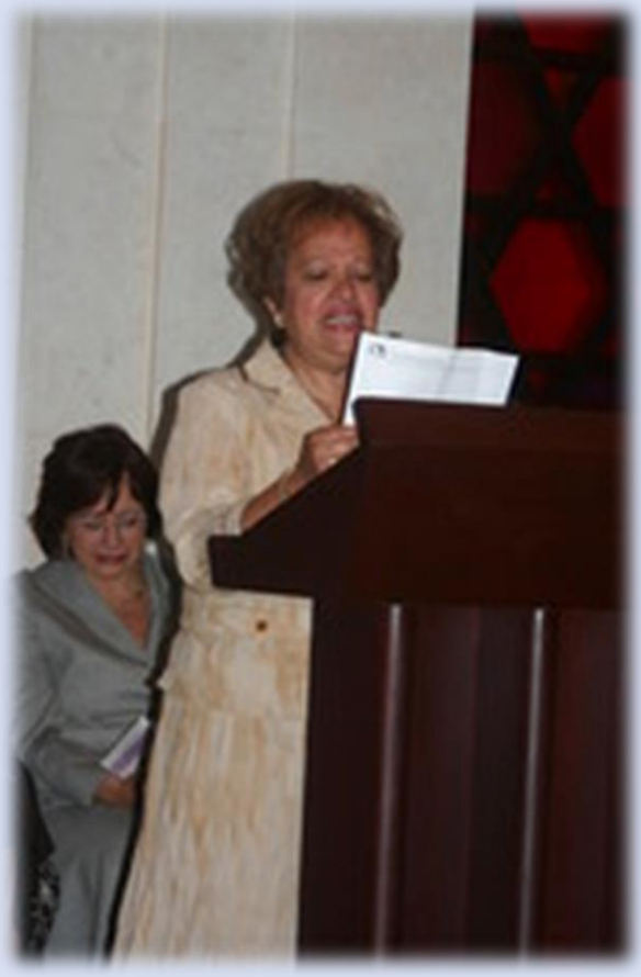
Ladies Bat Mitzvah 2009 Spanish & Portuguese Synagogue of Montreal