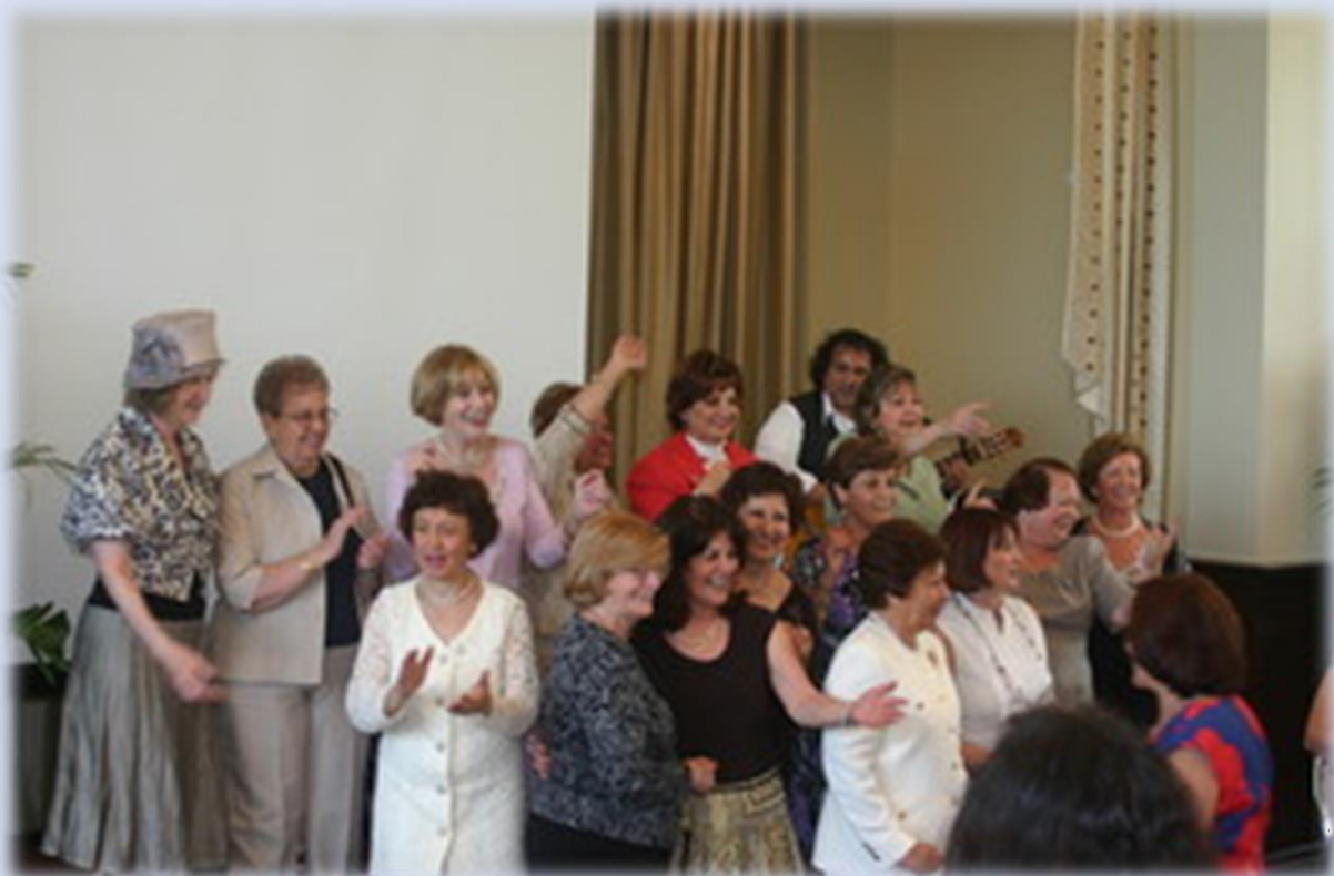
Ladies Bat Mitzvah 2009 Spanish & Portuguese Synagogue of Montreal