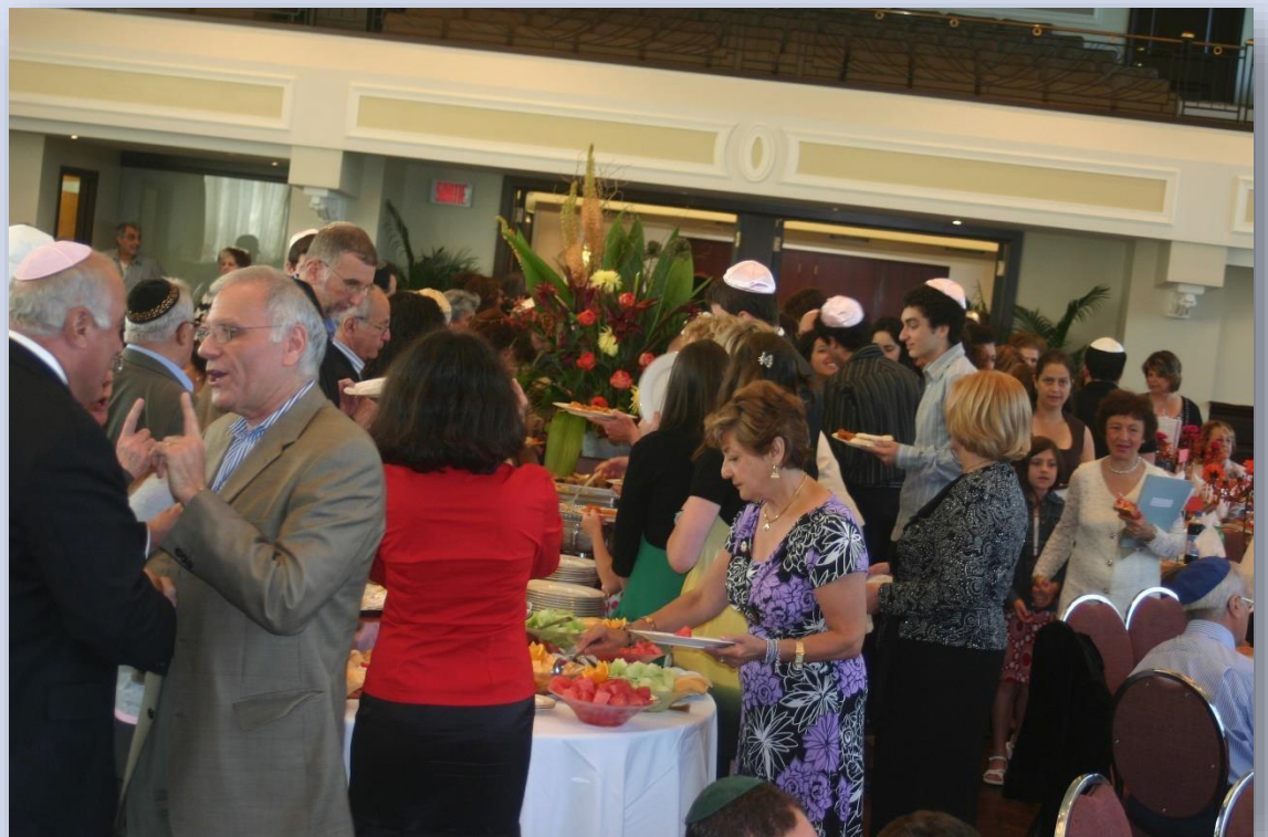
Ladies Bat Mitzvah 2009 Spanish & Portuguese Synagogue of Montreal