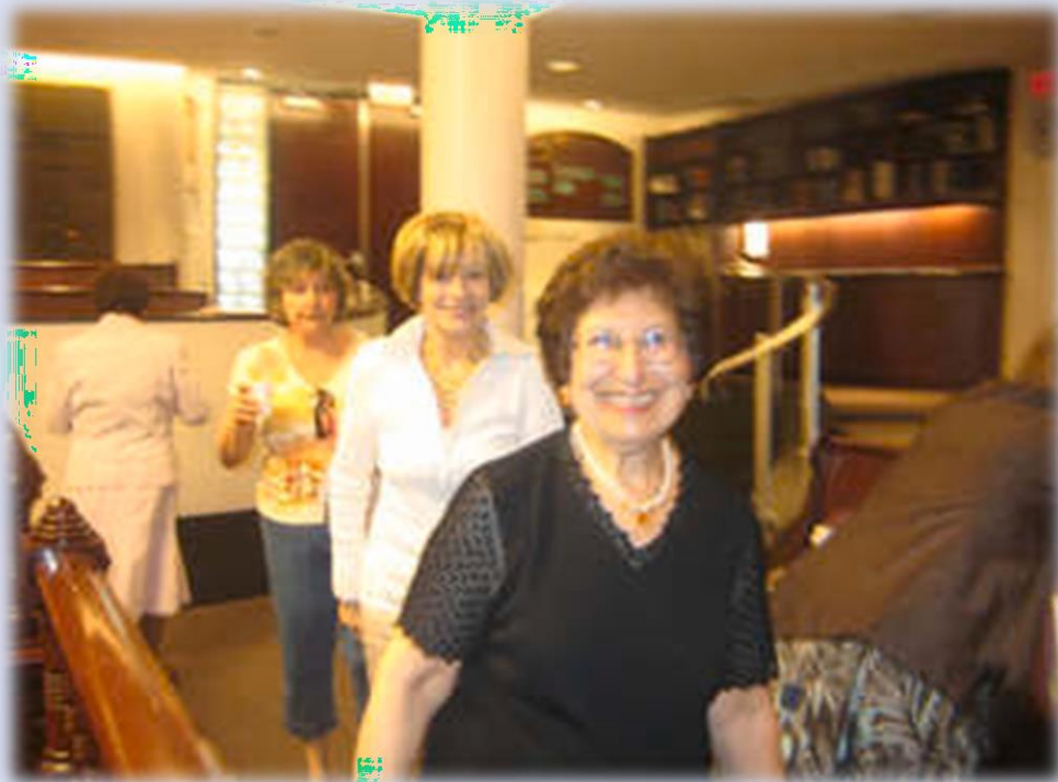
Ladies Bat Mitzvah 2009 Spanish & Portuguese Synagogue of Montreal