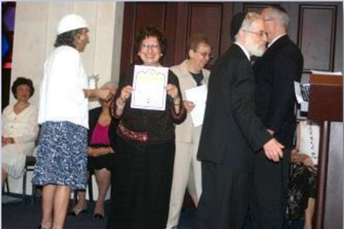
Ladies Bat Mitzvah 2009 Spanish & Portuguese Synagogue of Montreal