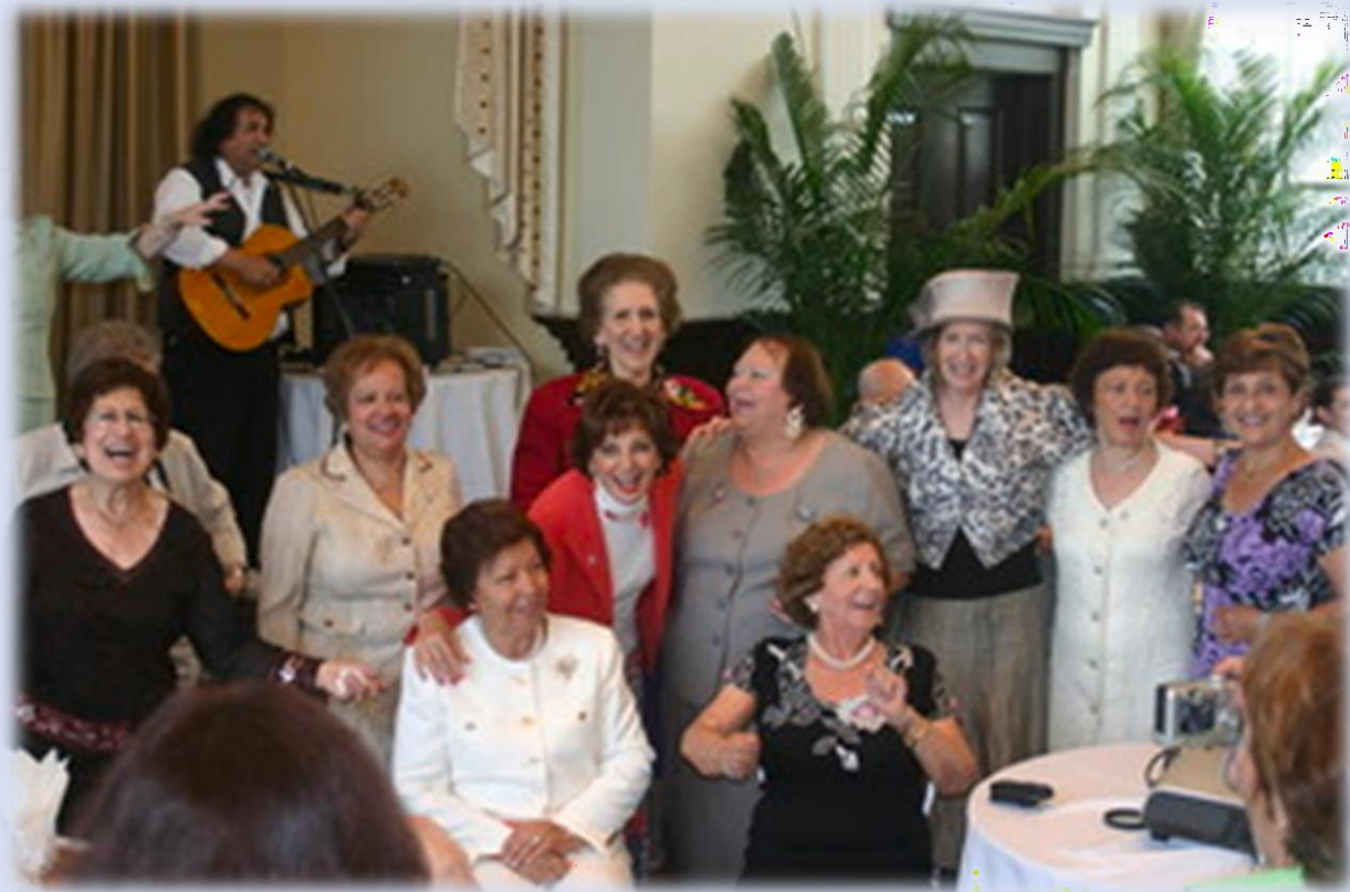
Ladies Bat Mitzvah 2009 Spanish & Portuguese Synagogue of Montreal