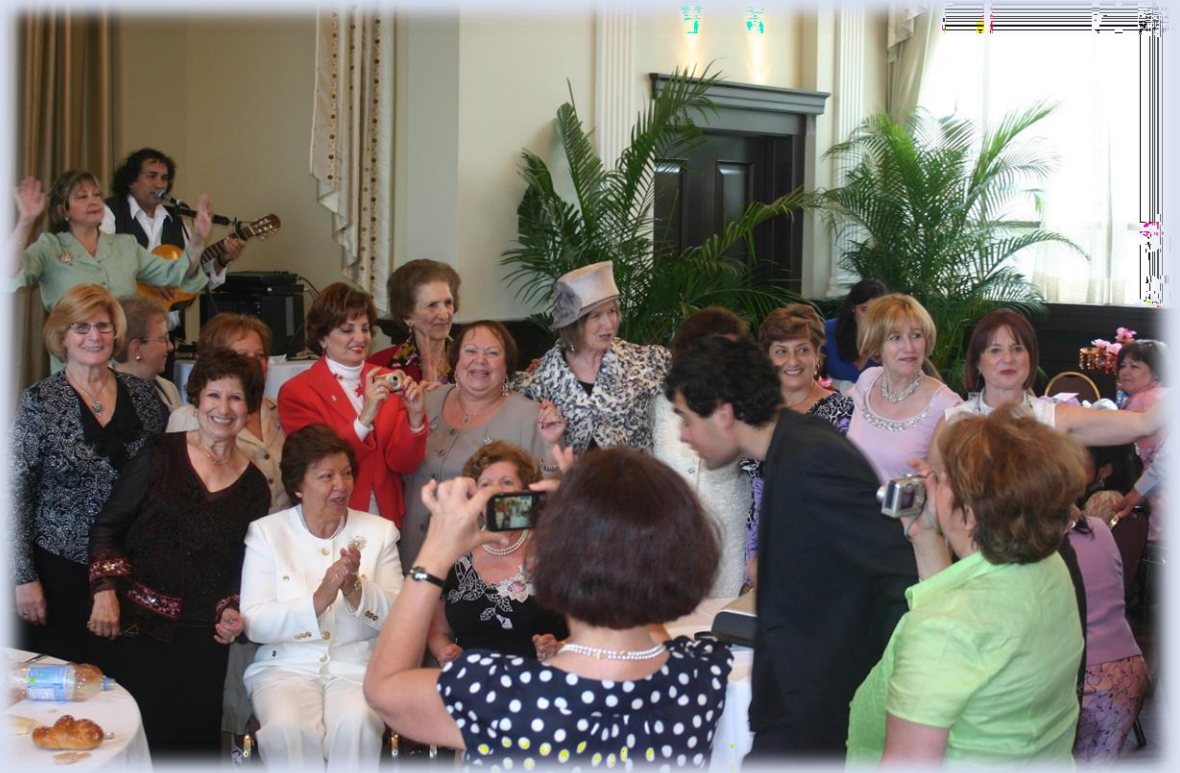
Ladies Bat Mitzvah 2009 Spanish & Portuguese Synagogue of Montreal