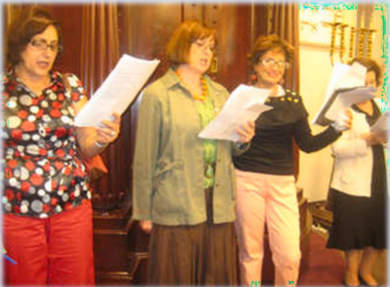
Ladies Bat Mitzvah 2009 Spanish & Portuguese Synagogue of Montreal