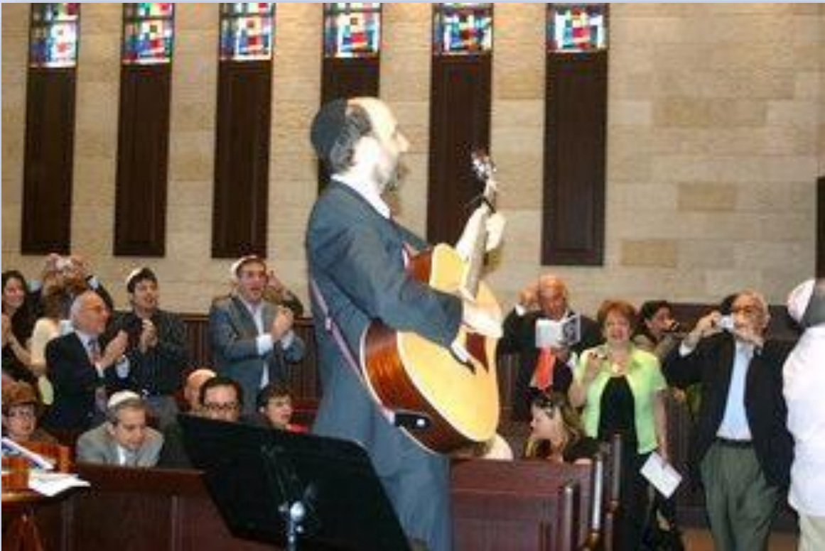
Ladies Bat Mitzvah 2009 Spanish & Portuguese Synagogue of Montreal