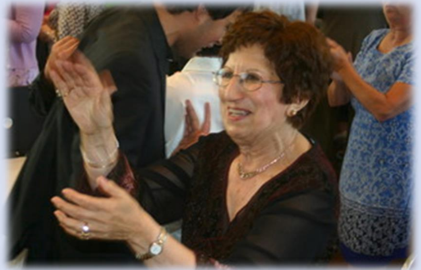
Ladies Bat Mitzvah 2009 Spanish & Portuguese Synagogue of Montreal